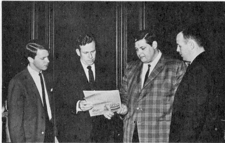
"... and if I use this coupon, I get a free fish sandwich?"